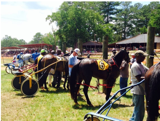
Prayer in "the paddock" as the horses are prepared for the post parade.