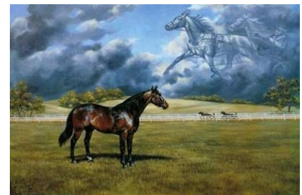
Rambling Willie Remembers

These lovely 5 x 7 Rambling Willie cards are packaged in sets of 10 cards. They are blank inside.