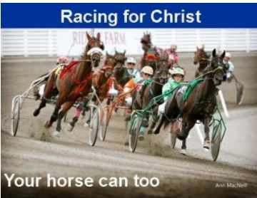
Racing for Christ