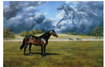
Rambling Willie Remembers

These lovely 5 x 7 Rambling Willie cards are packaged in sets of 10 cards. They are blank inside.