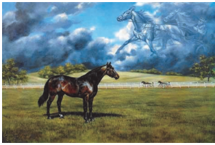
Rambling Willie In God We Trust