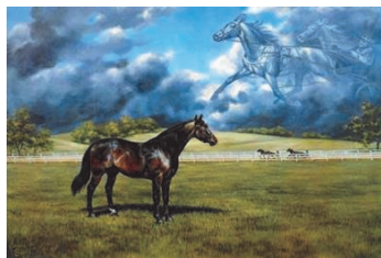
Rambling Willie Remembers