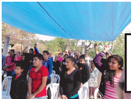
Revival with the Mexico scholarship recipients

We were blessed last week with the birth of a little baby girl who will be a week old Tuesday, 1/19. She is our 5 th great grandchild.