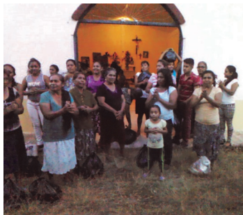
Food Distribution after prayer service at chapel in Mexico