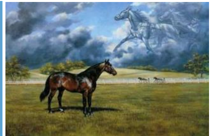
Rambling Willie Remembers

These lovely 5 x 7 Rambling Willie cards are packaged in sets of 10 cards. They are blank inside.