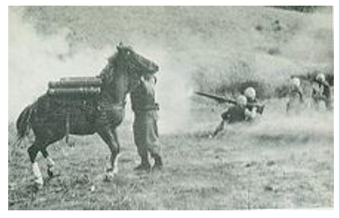
Sergeant Reckless Under Fire

'Downloading God' has short chapters all themed around a clever computer technology motif which makes the timeless truths of God both real and relevant to contemporary culture. See page 3 to order