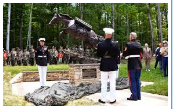
A memorial to Sergeant Reckless in Semper Fidelis Memorial Park at the National Museum of the Marine Corps