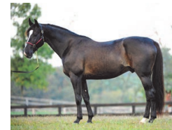
Four Starz Robro