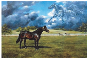
Rambling Willie Remembers