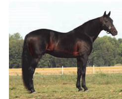
The Fraternity Pan