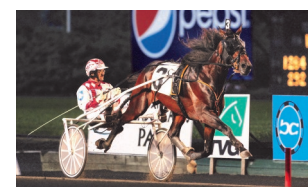
Western Shore

See page 4 for Bid Instructions and other important information.