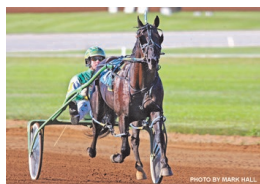
Up the Credit