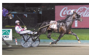
Detour Hanover