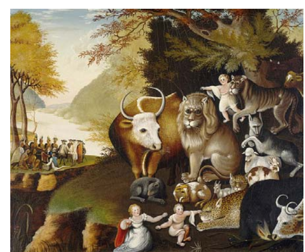
Wikepedia.org Edward Hicks - Peaceable Kingdom.jpg

Copyright 1955 by Jan-Lee Music. Copyright renewed 1983. International copyright secured. All rights reserved. http://www.jan-leemusic.com/Site/Copyrighted_Lyrics.html Printed with permission